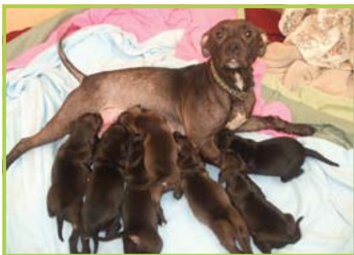
Grace and her puppies relax in the puppy room.

As part of our community outreach and fundraising efforts, we had been conducting informational tables at the PETCO stores in Dewitt and Mattydale. Because of this relationship, we were eligible to apply online to the PETCO Foundation for a capital improvement grant. It seemed to be a good fit, so I completed the application, attached the requested documentation, and after a few "final reviews"