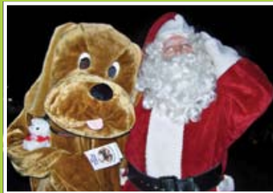
Humane Mascot with Santa Claus